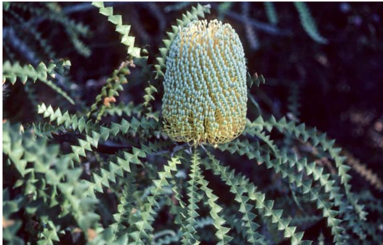
Banksia speciosa , near Esperance, W. Australia. The genus is endemic to Australia.